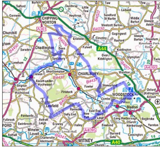
The Wychwood Way