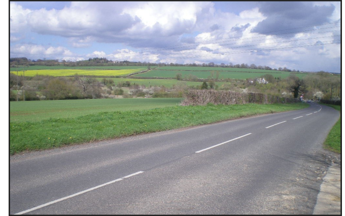
View towards Finstock Railway Station

Part of a series of circular walks that link in with The Wychwood Way