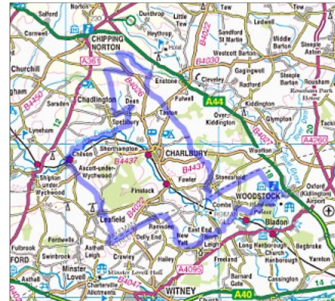
The Wychwood Way

This is an ancient trackway that runs from north Oxfordshire towards Oxford city along the parish boundary. There is evidence of Roman settlement around Sansomes Platt.